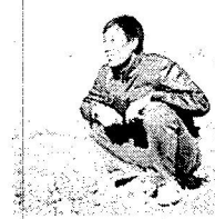
China's land reforms aim to revolutionize 750 million lives