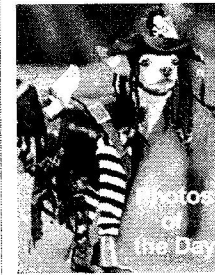
In Photos: The best photos from September 26, 2008