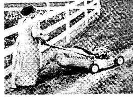
The Amish go solar - in a simple way